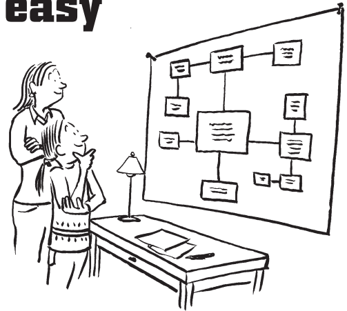
diagram into paragraphs. The opening paragraph should contain her main idea, and the first sentence of each subsequent paragraph should come from one of the subtopics in her plan. Then, she can fill out each paragraph with facts from the small boxes.

Your child can write her paper logically by converting the ideas from her