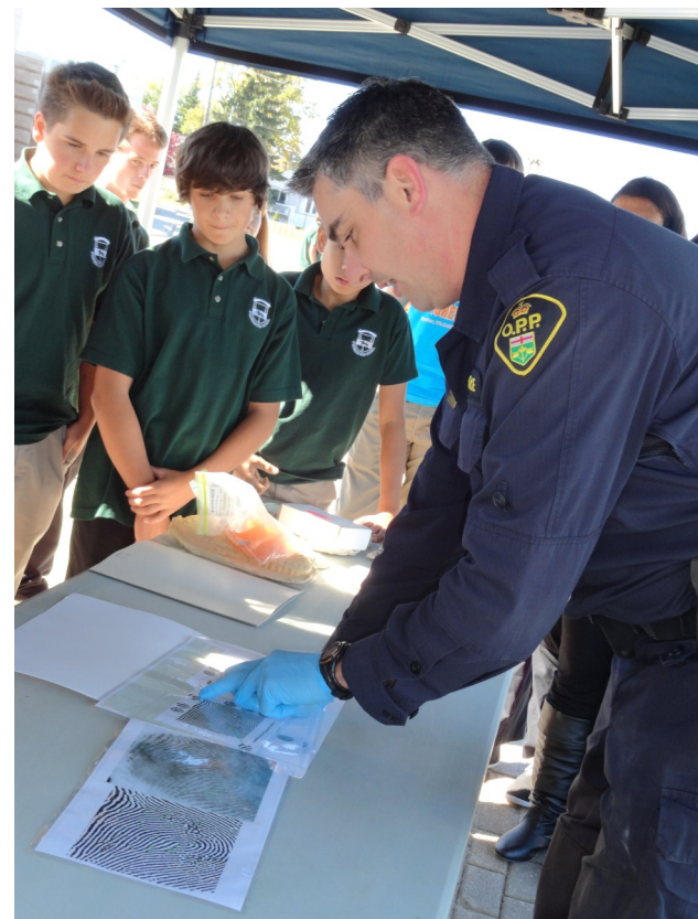
Members of the OPP Forensics Unit showed students the unique features of fingerprints. They also shared what education and skills a person needs in this career field.