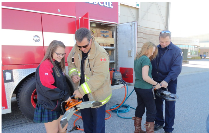
Students learning how to operate the jaws of life with the help of members of the Timmins Fire Department.

It sure does! When students have a chance to interact with professionals about their careers and to touch expensive, specialized equipment, they get engaged and learn a great deal. Most importantly, kids quickly figure out what types of jobs they don't like ... and sometimes that kind of knowledge saves them time and money later on when they graduate from high school and move on to post secondary education.