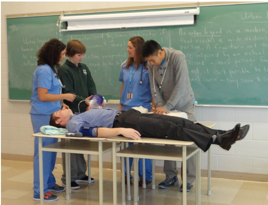
Students practice CPR with TDH Medical Students during the SHSM Career Fair.