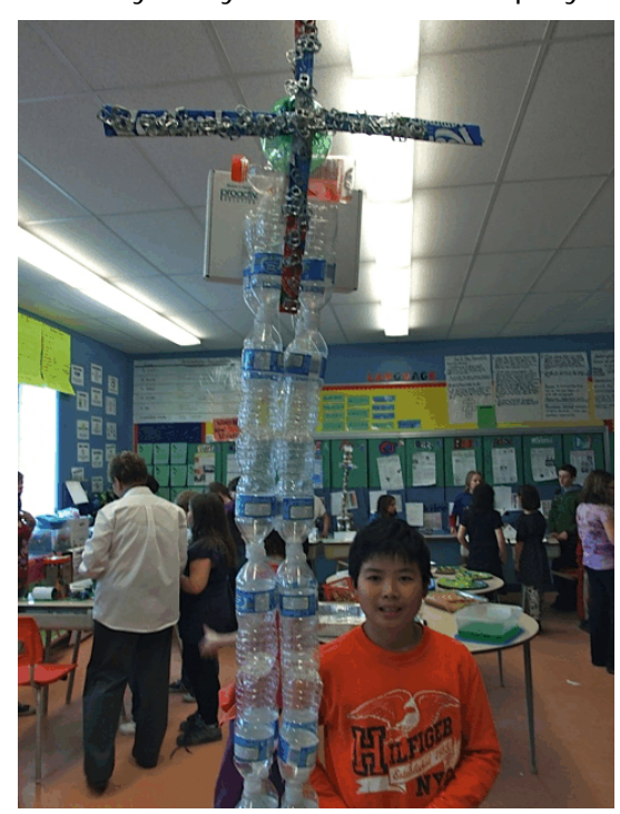
of the Easter Story-Writing