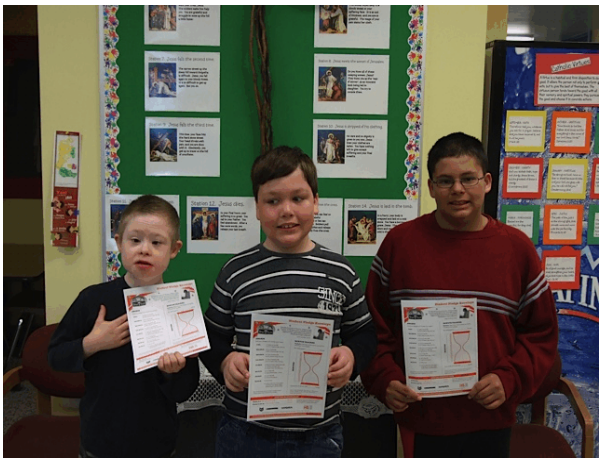
Hop to it ... treats all around!