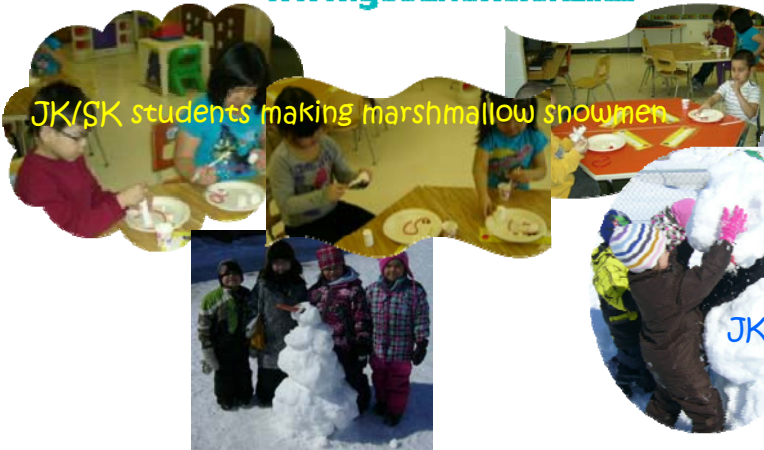
JK/SK students making marshmallow snowmen