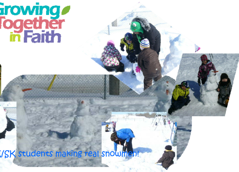
JK/SK students making real snowmen!