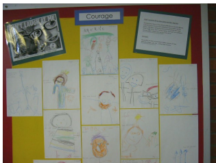
Courage -presented by JK/SK Class