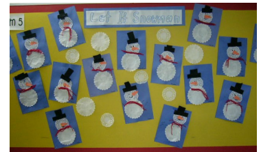
"Let It Snowman" JK/SK Class