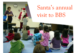
Santa's annual visit to BBS