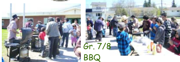
Gr. 7/8 BBQ

Discovery Science: On Tuesday, June 18th, the ASUS Science from Queen's University will have hold workshops for the students in their classrooms.