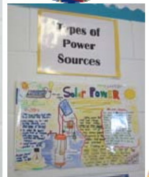
Types of Power Sources Gr. 5/6