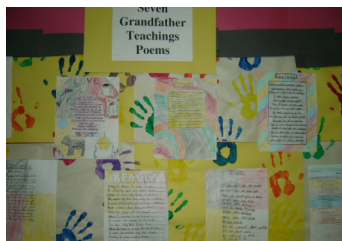
Seven Grandfathers Teachings Poems-Gr. 7/8