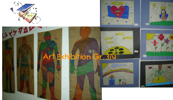
Art Exhibition Gr. 3/4