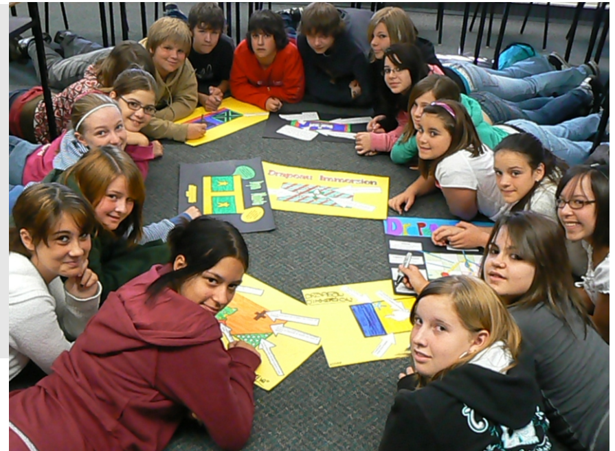
O’Gorman Intermediate Catholic School, Grade 8 French Immersion class